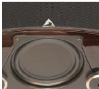
Downward-firing bass radiator