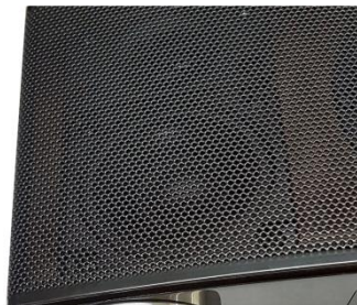
Acoustically transparent metal grille