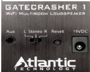
Flexible Speaker Configuration

High-Performance 2.1 Stereo Sound at Your Command