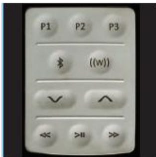
Color-coded programmable backlit controls