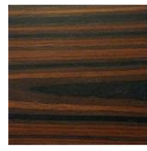
Makassar Ebony Veneer